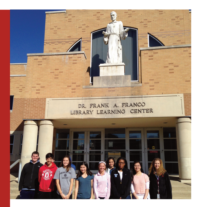
Wyomissing Area High School ninth graders visit Alvernia University on March 30, 2016.